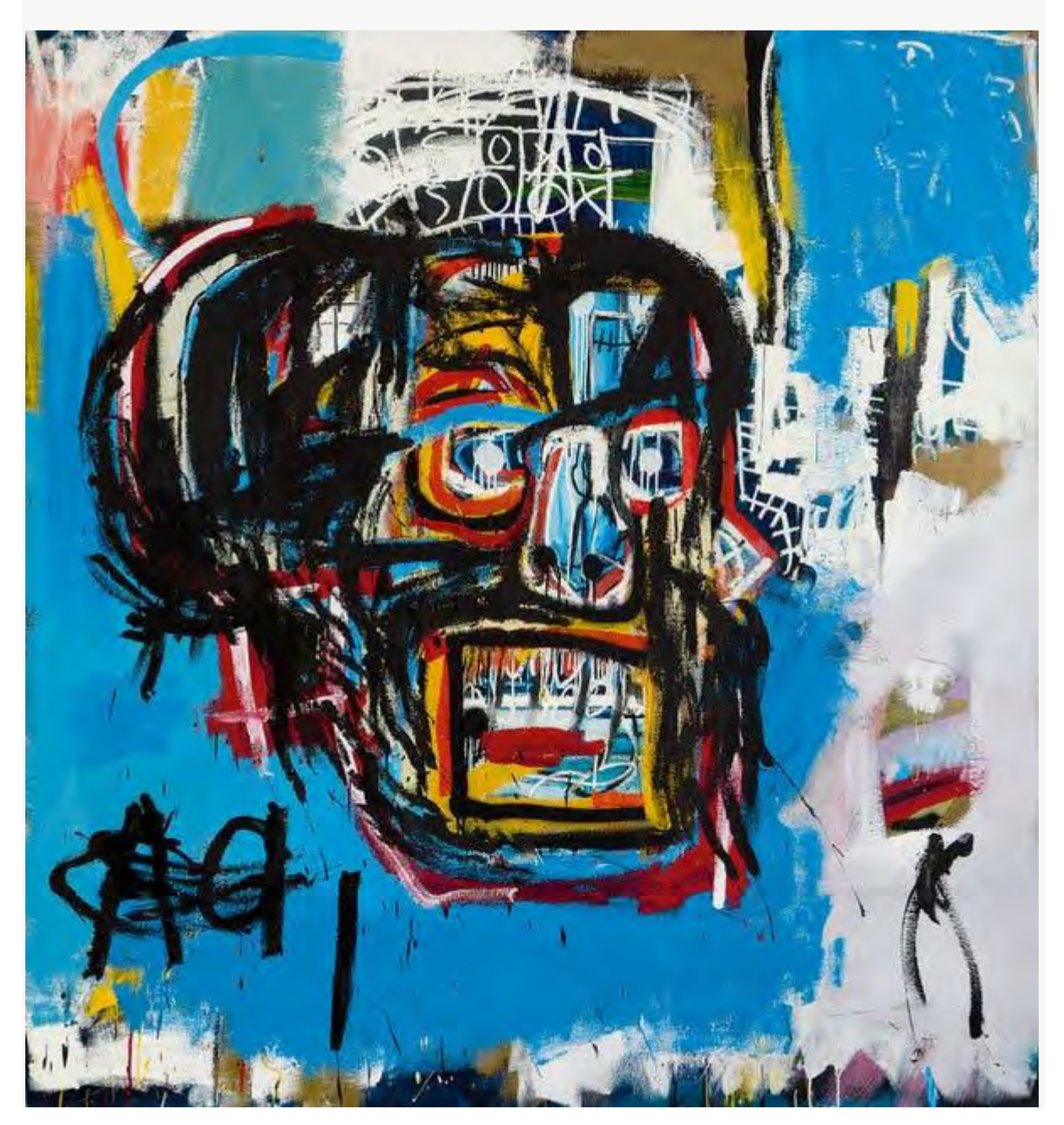
Jean-Michel Basquiat's "Untitled" from 1982 in acrylic, spray paint and oilstick on canvas sold for $110.5 million in 2017. Estate of Jean-Michel Basquiat, via Sotheby's.

"We did sell the most expensive painting of the 20th century," said the Christie's specialist Alex Rotter. "This is a big achievement." The 40-inch-by-40-inch painting, a trophy given its vibrant colors and glamorous subject matter, eclipsed the previous high price of $110.5 million for a Basquiat skull painting at Sotheby's in 2017 as well as Warhol's auction high for a car crash painting that sold for $105.4 million in 2013.