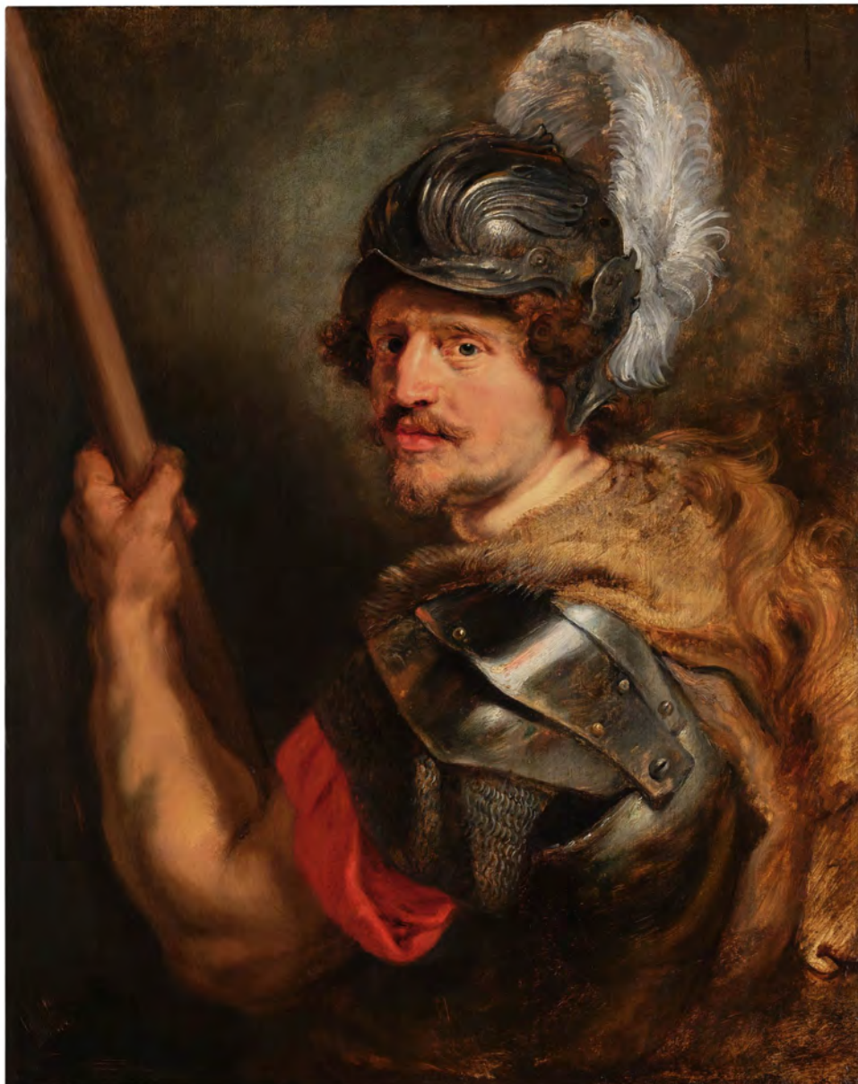
Peter Paul Rubens, Portrait of a Man as Mars (ca. 1620). With an estimate of $20 million to $30 million, it sold for $26.2 million.

Surprisingly—and indicative of brazen category creep practiced by the auction houses—the modern sale included a 400-year-old painting, Portrait of a Man as Mars (ca. 1620), by Peter Paul Rubens. It was one of four lots guaranteed by Sotheby's without being backed by an irrevocable bid. Estimated at $20 million to $30 million, it fetched $26.2 million, the fourth-highest price for the Dutch Old master.