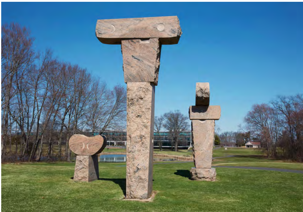
Isamu Noguchi, The Family (1956–57). Estimated at $6 million to $8 million, it sold for an artist-record $12.3 million.

Another record-setter was Isamu Noguchi's monumental stone trio, The Family (1956–57), which sold for $12.3 million, surpassing the high estimate of $8 million and notching a new high for the Japanese American artist. It included a 16-foot 'father,' 12-foot 'mother' and 6-foot 'child' statue, and was commissioned by the famed modernist architect Gordon Bunshaft in 1956.