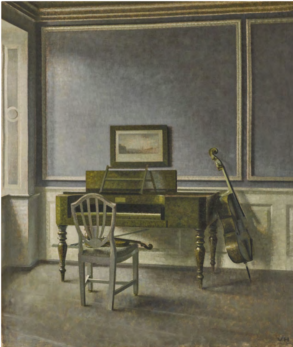
Vilhelm Hammershøi, Interior. The Music Room, Strandgade 30 (1907). Estimated at $3 million to $5 million, it sold for $9.1 million.

Not every performance was as starry as Ostin's musical roster. Works by Pablo Picasso, Joan Mitchell, and Arshile Gorky hammered below their low estimates. Cy Twombly's 1962 Untitled painting was the most stark example, with Barker releasing it on an offer of $10 million, compared with the $14 million low estimate.