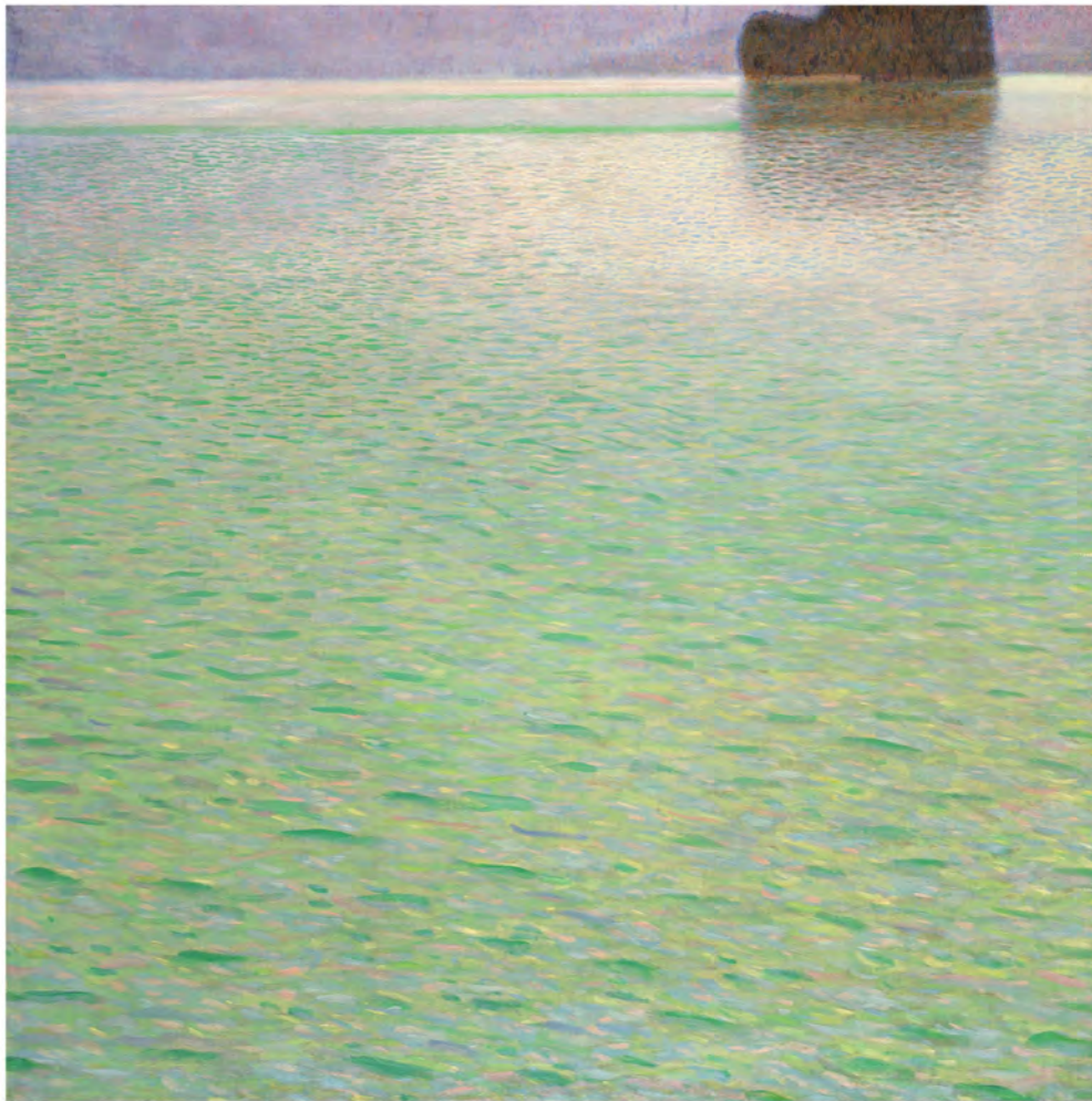
Gustav Klimt, Insel im Attersee (ca. 1901–2). With an unpublished estimate, it sold for $53.2 million.

“Mo’s love of art was second only to his love of music,” his friend the actor (and fellow art aficionado) Steve Martin once said.